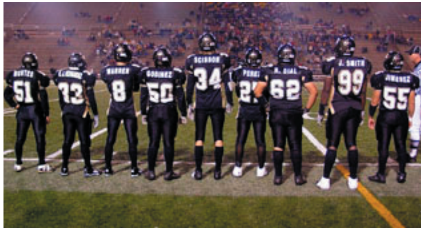
Offensive, Defensive, Hustlin' Hornets of the Week: Senior Members of the 2004-05 Team